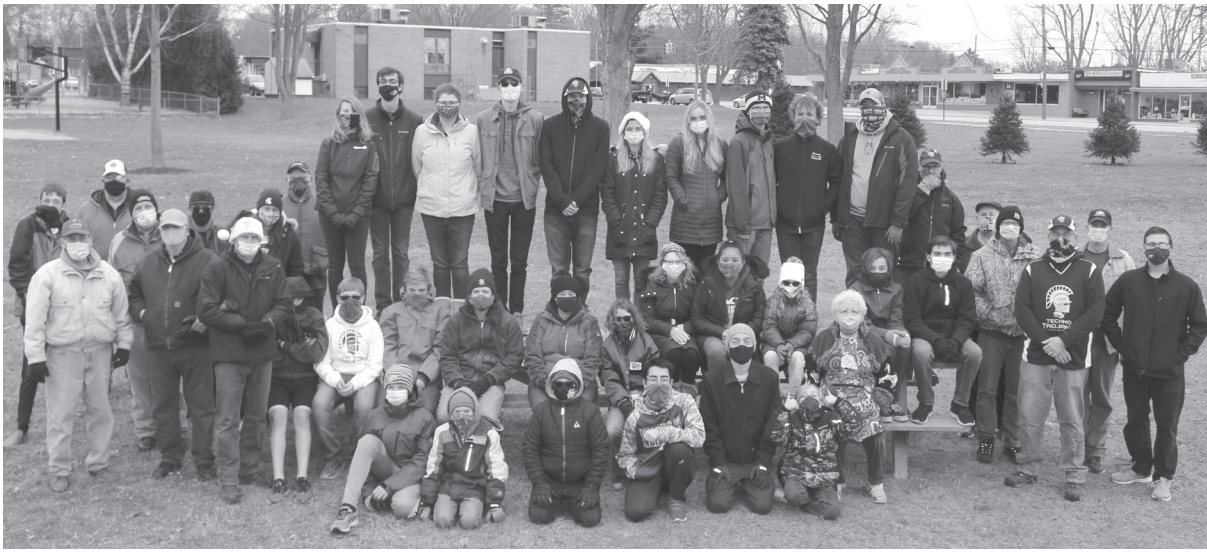
The group that helped the Lions Club set up the trees in Pomona Park during the Christmas / Holiday season. The group included individuals from the Fruitport Schools Robotic Club and local Boy Scouts. There were one main 12 ft tree and twelve 7 ft trees.