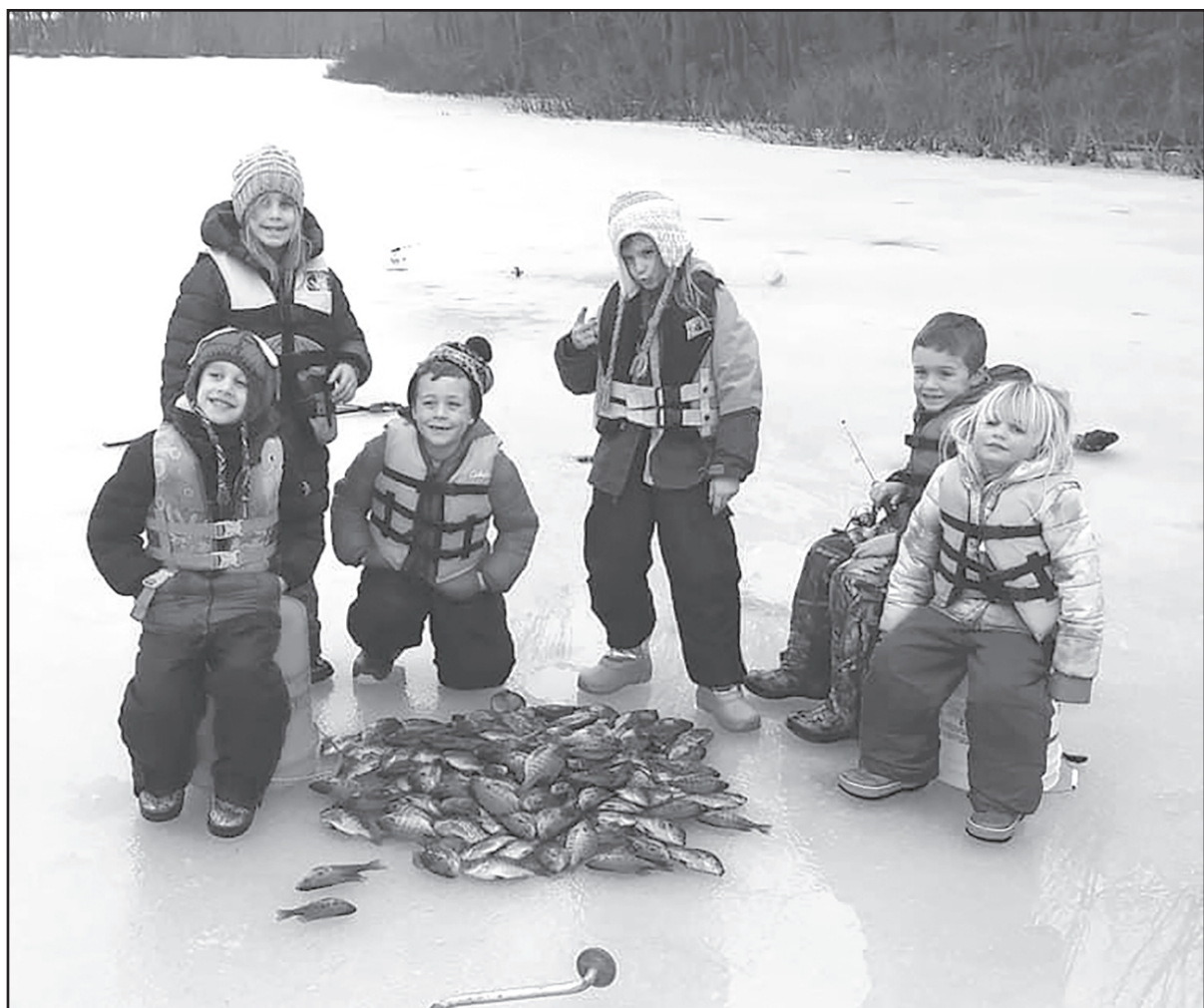
Enjoying Michigan Wonderland while the snowbirds go south. They may have had a little help catching those fish.