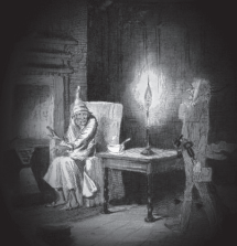
By Charles Dickens