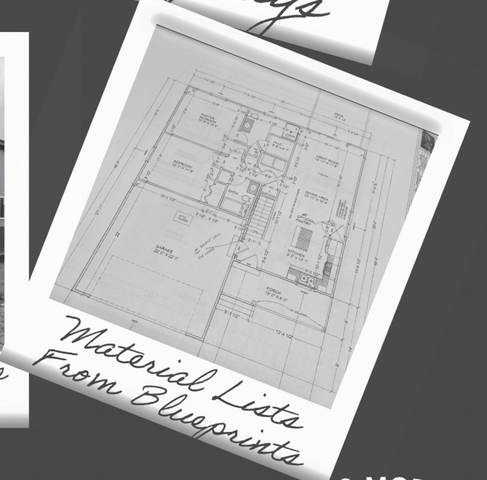
Material Lists From Blueprints

*WINDOWS * DOORS * SIDING * ROOFING * DECKING * TRIM * INSULATION * FLOORING * & MORE!*