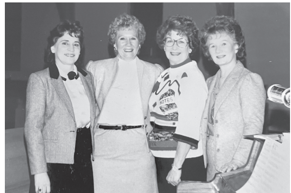
The Veldman Sisters Trio