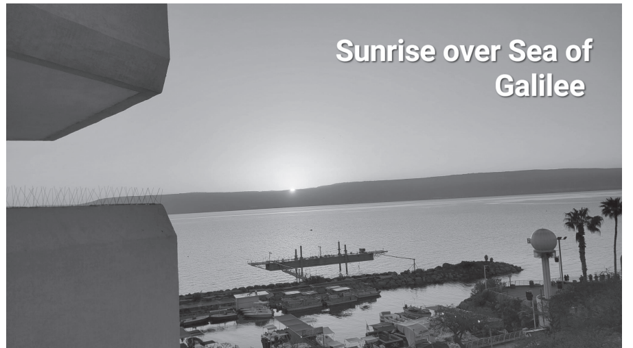
Sunrise over Sea of Galilee

I did not know that the Sea of Galilee was about the size of Torch Lake and is fresh water