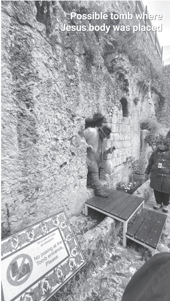
Possible tomb where Jesus body was placed

I did not know that the Sea of Galilee was about the size of Torch Lake and is fresh water